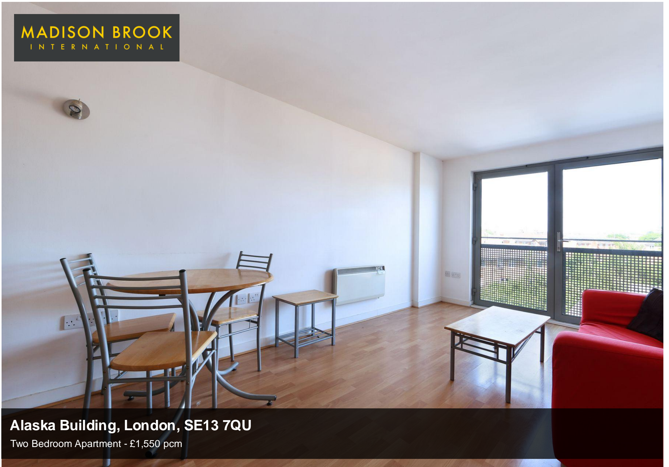
Alaska Building, London, SE13 7QU Two Bedroom Apartment - £1,550 pcm